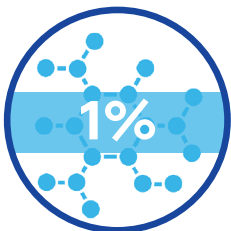
Cost of Infection Treatment