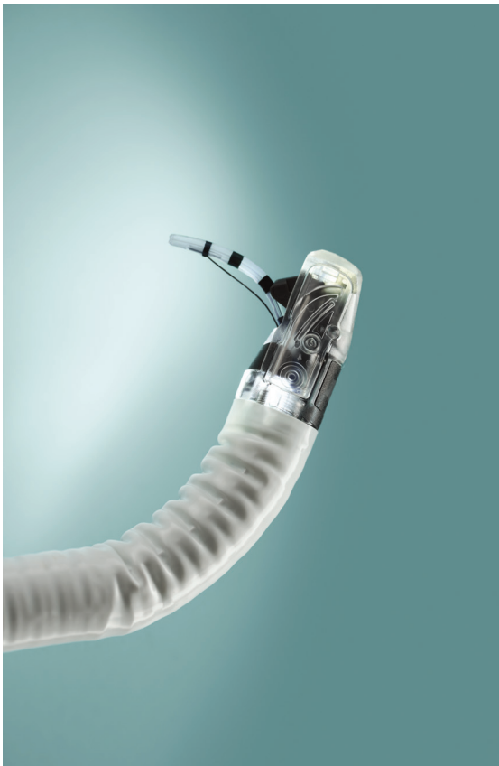
Distal tip showing elevator in use with a sphincterotome

Familiar design and function to that of conventional duodenoscopes