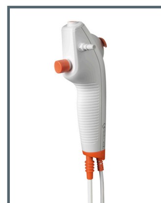
The ergonomic and lightweight handle is designed to give you a firm and comfortable grip