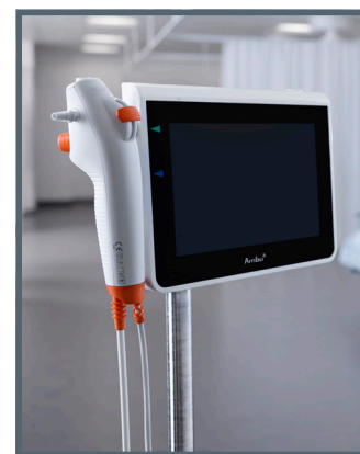
Ambu® aScope™ 4 Broncho Large and Ambu® aView™