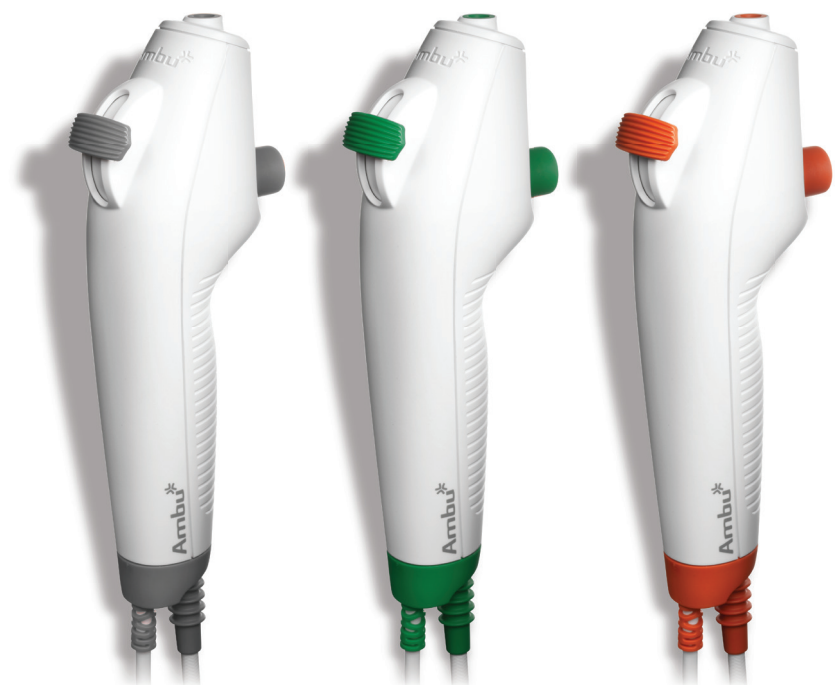
aScope 4 Broncho Slim 3.8/1.2 180°/180°

Includes three sizes for multiple procedures and the aScope BronchoSampler, a tailor-made solution that helps simplify the sampling process