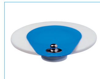
S = Stud