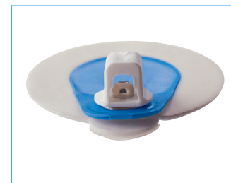
F = 3 mm fitting