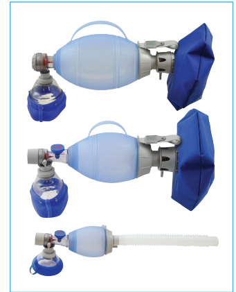
Ambu Silicone Face Mask connected to Ambu Oval Plus Silicone Resuscitators

Questions? Contact your Ambu representative at 800-262-8462 or visit ambuUSA.com