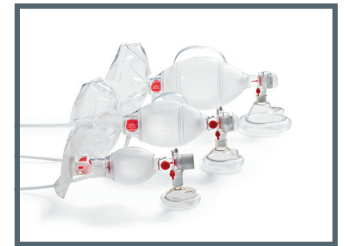
SPUR II with bag reservoir