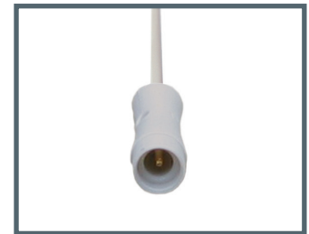
SC = 0.7 mm connector