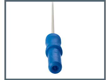
J = 2 mm connector