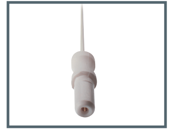
K = 1,5 mm connector