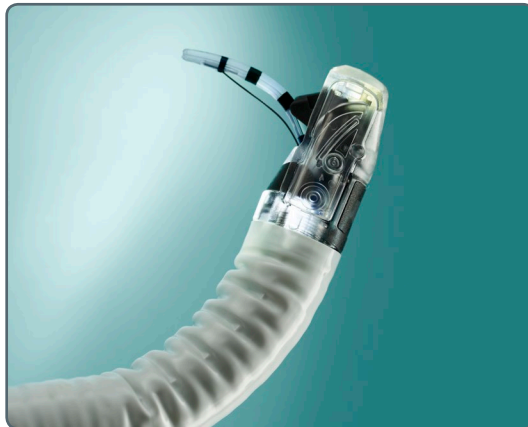
Distal tip showing elevator in use with a sphincterotome