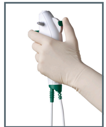
The ergonomic and lightweight handle is designed to give you a firm and comfortable grip