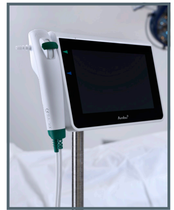
Ambu® aScope™ 4 Broncho Regular and Ambu® aView™