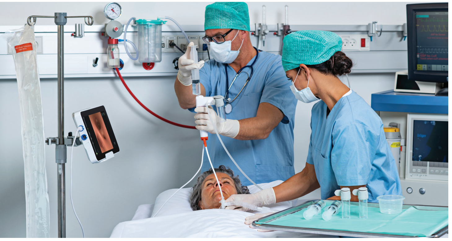
The aView 2 Advance monitor is easy to maneuver into a comfortable working position close to you and your patient

The aView 2 Advance monitor is easy to maneuver into a comfortable working position close to you and your patient. The monitor fits into small spaces and can be rotated 180 degrees, allowing you to connect it in the best position for that specific clinical situation. The graphical user interface will adapt automatically.