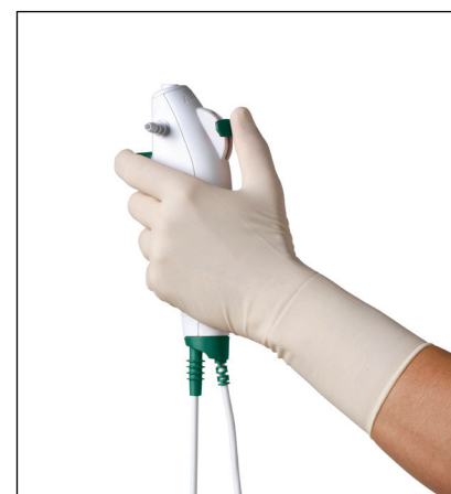
The ergonomic and lightweight handle is designed to give you a firm and comfortable grip