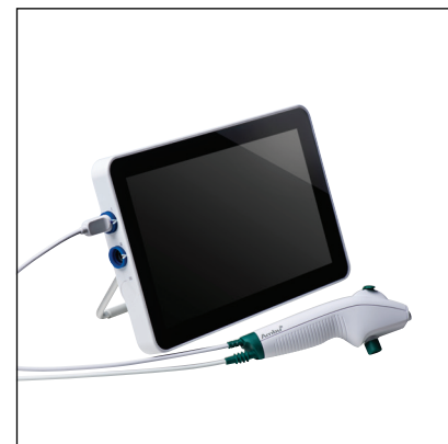
Ambu aScope 4 Broncho Regular and Ambu aView 2 Advance