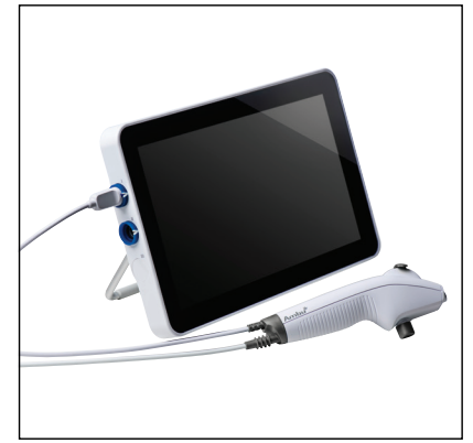
Ambu aScope 4 Broncho Slim and Ambu aView 2 Advance