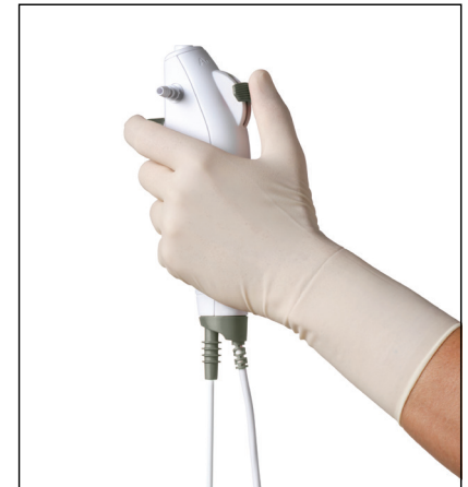
Ergonomic and lightweight handle designed to give you a firm and comfortable grip