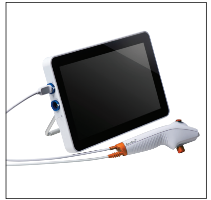
Ambu aScope 4 Broncho Large and Ambu aView 2 Advance