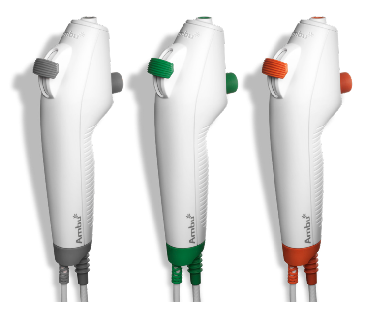
aScope 4 Broncho Slim 3.8/1.2 180°/180°

Includes three sizes for multiple procedures and the aScope BronchoSampler, a tailor-made solution that helps simplify the sampling process