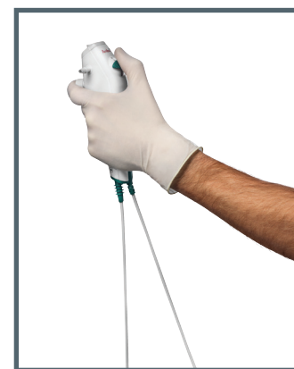
The ergonomic and lightweight handle is designed for optimal user comfort