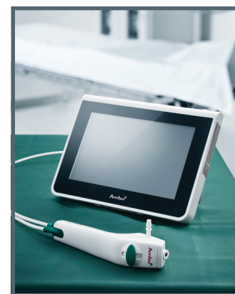
Ambu® aScope™ 3 and Ambu® aView™