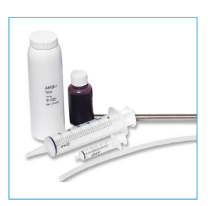
Accessories for Ambu IV Trainer