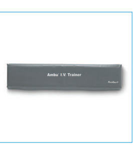
Packed in a robust bag