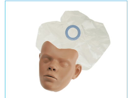
Unique Ambu Hygienic System