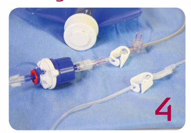
Move both C-Clamps to the open position.