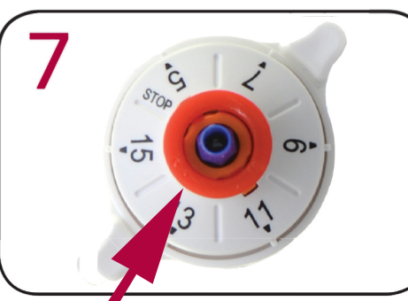
Please DO NOT Touch the RED Locking Ring