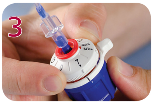
To set the Regulator to desired flow rate, rotate the white dial and align with black position indicator. Increase flow rate turn counter clockwise. Decrease flow rate turn clockwise.