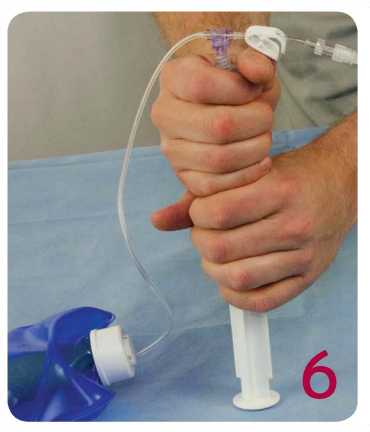
If manually filling, use both hands to decompress the syringe. Fill to prescribed volume. Pump is equipped with a downline air filter, no need to evacuate air.

Connect syringe to the Fill Port or if using electric filler, connect tubing to Fill Port.