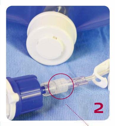
Attach Ambu Regulator to reservoir. Do not over tighten.

The Ambu ACTion Pain Pump is conveniently packaged in three simple pouches. Remove reservoir, syringe and labels from pouch. If not priming, leave regulator in pouch.