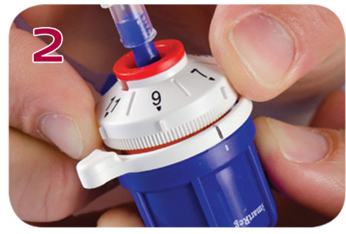
Gently pull white dial up on regulator.