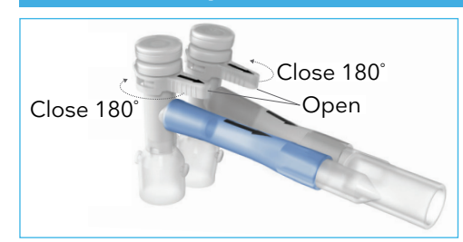
Operation of the Y-connector available with the VivaSight 2 DLT. In the illustration, both lumens are open for ventilation.