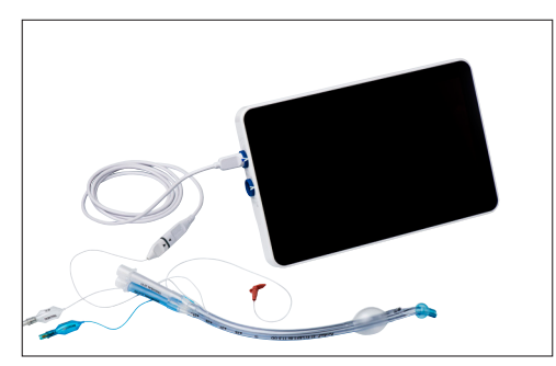
\label{eq:ambu} Ambu^{\otimes}\, VivaSight^{\mathsf{TM}}\, 2\,\, DLT\,\, connected\,\, to\\ Ambu^{\otimes}\, aView^{\mathsf{TM}}\, 2\,\, Advance\,\, Monitor