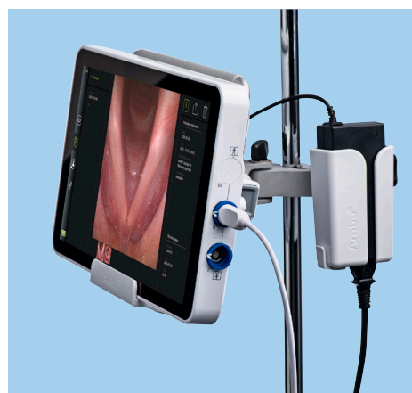
aView 2 Advance on IV pole