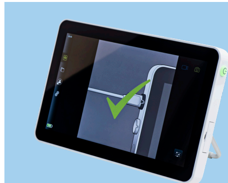
aView 2 Advance rotated 180-degrees