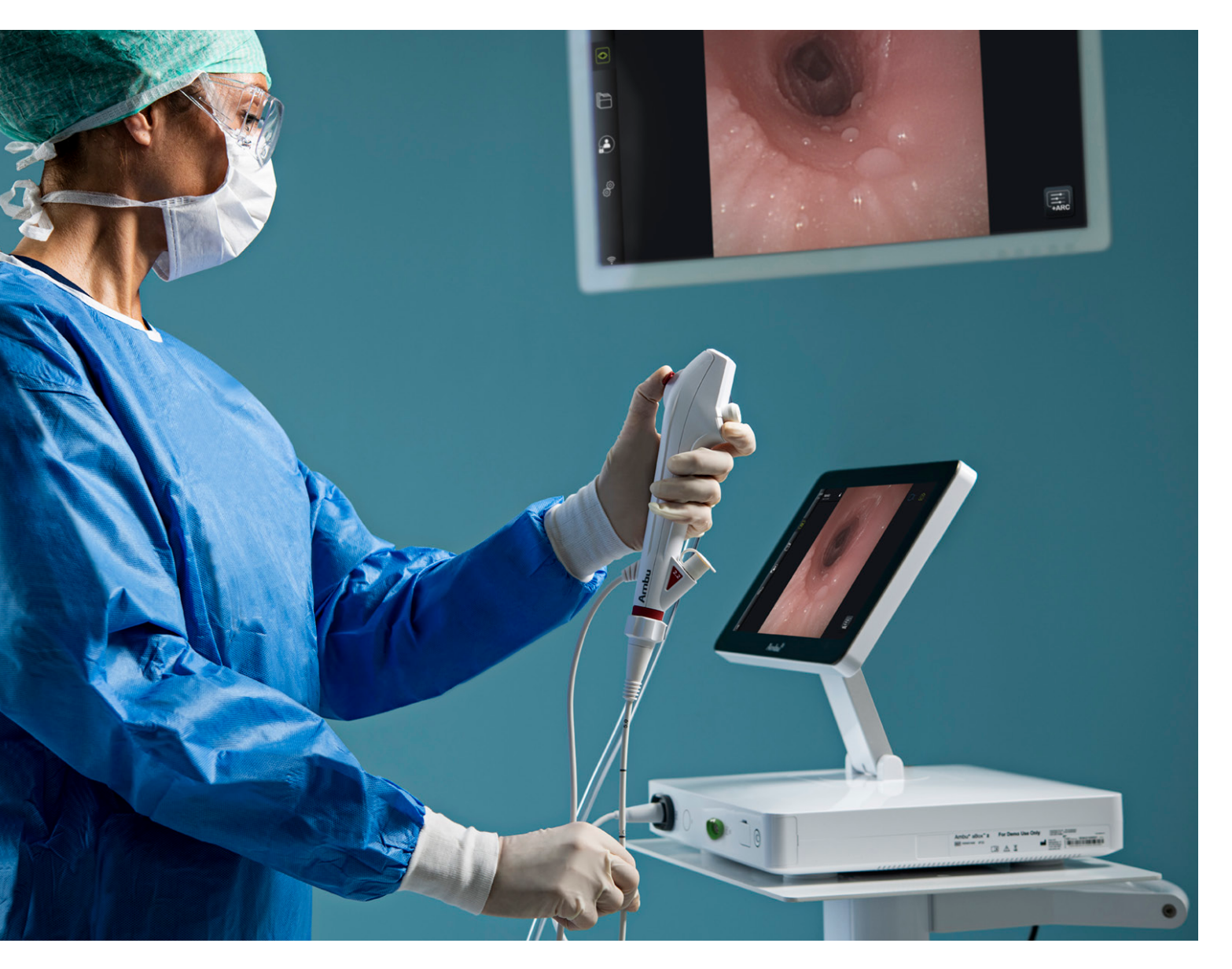
The aScope 5 Broncho HD Sampler Set was designed to work together as one closed-loop system