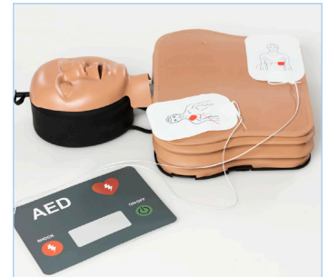
Placement of AED pads