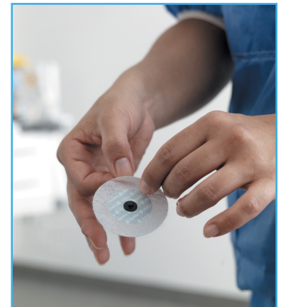
WhiteSensor 4440 long monitoring

Questions? Contact your Ambu representative at 800-262-8462 or visit ambuUSA.com