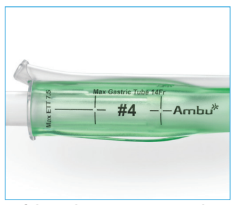
Soft bite absorption area with helpful markings and accessory size information.

Ambu, Inc. 6721 Columbia Gateway Drive Suite 200 Columbia, MD 21046 Tel. 800 262 8462 Fax 800 262 8673 ambu USA.com