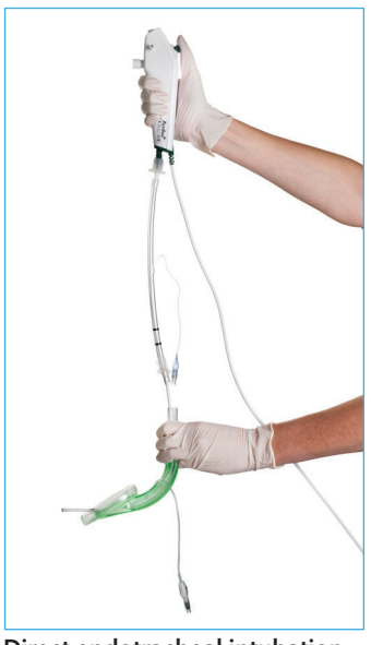
Direct endotracheal intubation using a flexible scope and standard ET tubes.